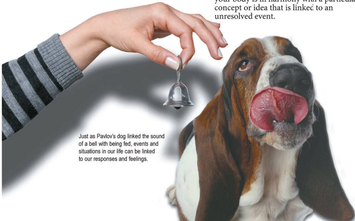
Just as Pavlov's dog linked the sound of a bell with being fed, events and situations in our life can be linked to our responses and feelings.

Finding and resolving these stuck patterns or memory loops is done with the help of a manual muscle test. This helps determine if your body is in harmony with a particular concept or idea that is linked to an unresolved event.