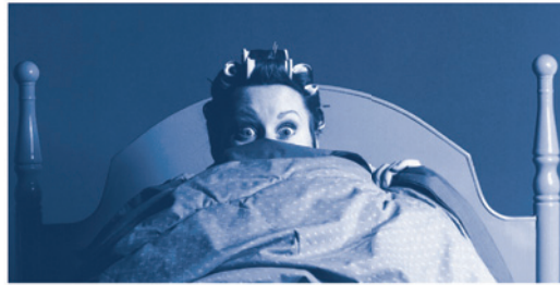
We always refer to all past memory events as an emotional reality, like a dream that may not be true, but our body thinks it is.

People used to think stress responses resided entirely in the brain. Now we know other parts of the body can have stress responses too. Ever felt 'butterflies in your stomach' before a speech or felt a 'lump in your throat'? Clearly, stress responses can happen in our body, not just our brain!